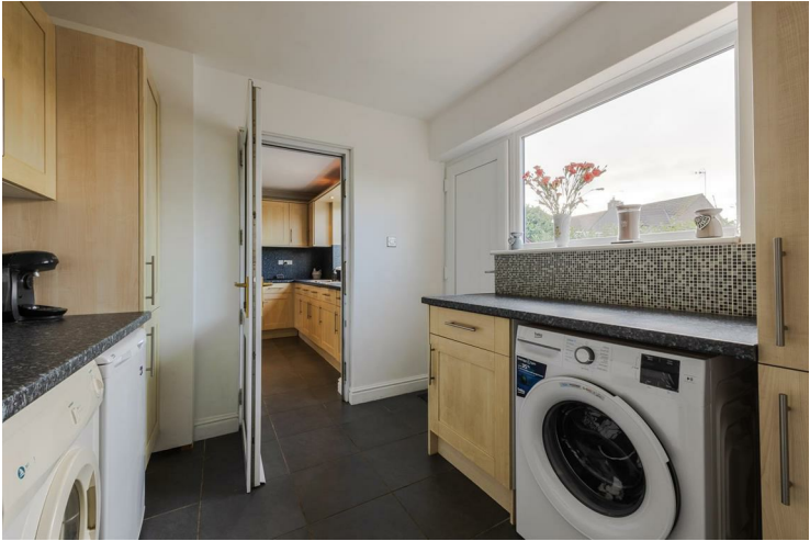
Utility 8'10" x 8'3" (2.71m x 2.54m)