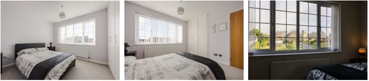
Bedroom two 10'9" x 10'4" (3.28m x 3.17m)