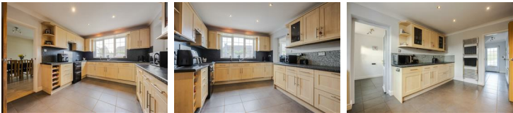
Kitchen 14'3" x 11'0" (4.35m x 3.37m)