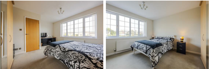
Bedroom one 12'11" x 12'8" (3.94m x 3.88m)