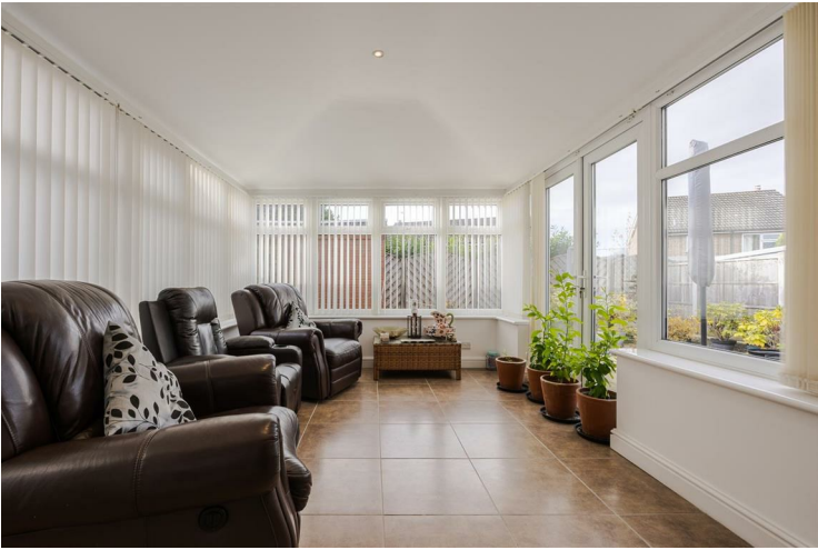
Garden Room 15'1" x 9'10" (4.60m x 3.00m)